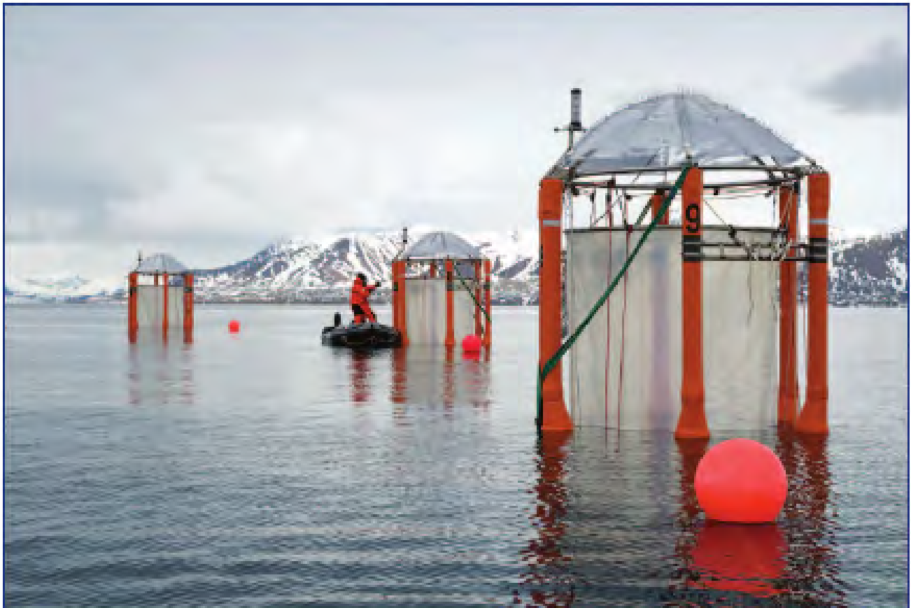
GEOMAR Mesocosms in Spitzbergen

adaptation. The group will identify gaps in research that need to be addressed and will develop a multi-driver “Best Practice Guide” to help this research field move forward in a coordinated manner. The group will mentor early-career scientists in the design process for complex multiple-driver manipulation experiments, familiarize them with the Best Practice Guide, and teach them practical methodologies for the analysis of their experimental findings. The group will build an interactive Web site on multiple drivers and marine biota to increase cooperation within this international research community, and to provide educational information at a variety of levels.