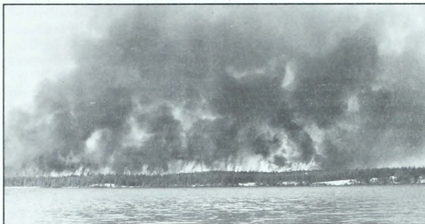
Picture of fire after evacuating.

Water bombers were called when the the warm windy weather returned on August 12. Believing the fire would be impossible to stop at this point, the firefighters evacuated, taking the