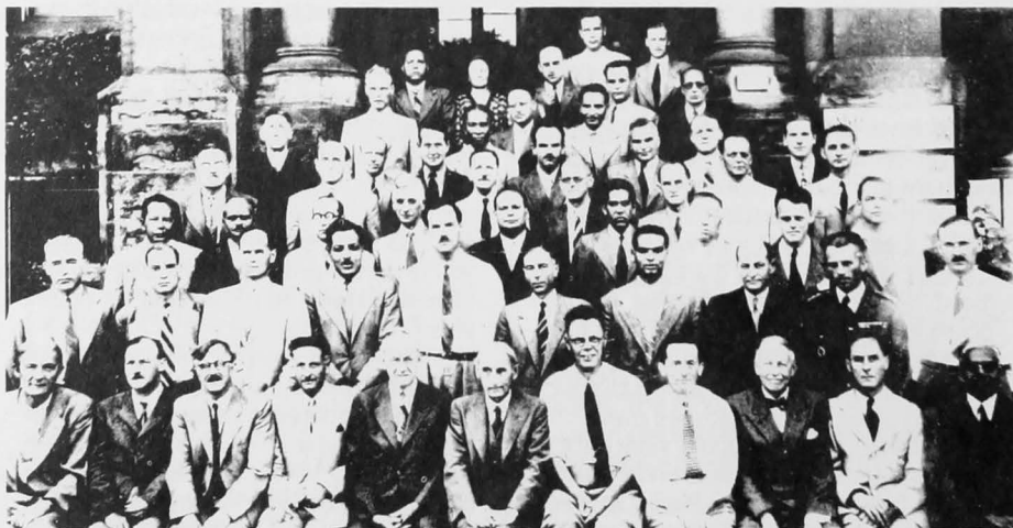
The participants of the commission for synoptic weather information (Toronto 1947)