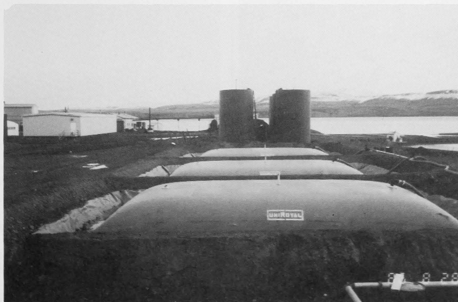
Eureka N.W.T. weather office.