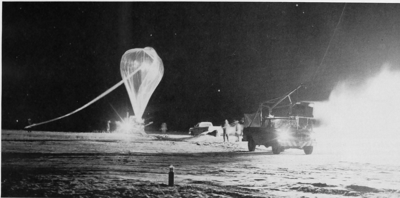
AES scientists carry out the pre-dawn launch of the Stratoprobe balloon in Saskatoon.