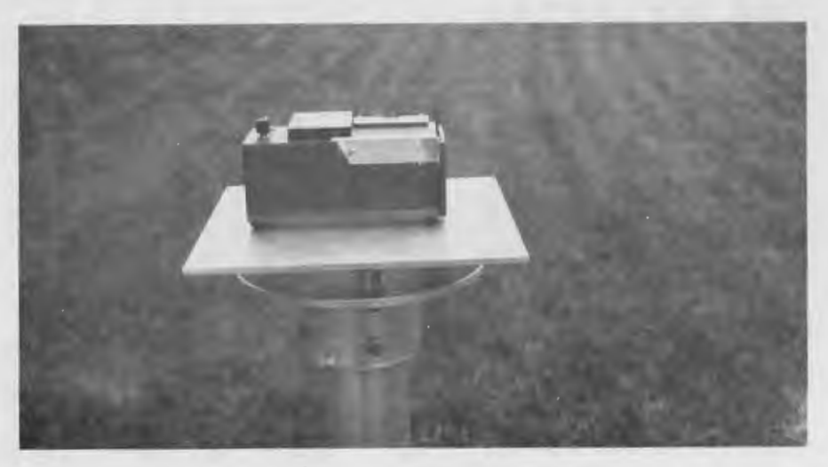
A close-up of the sunphotometer on its stand.