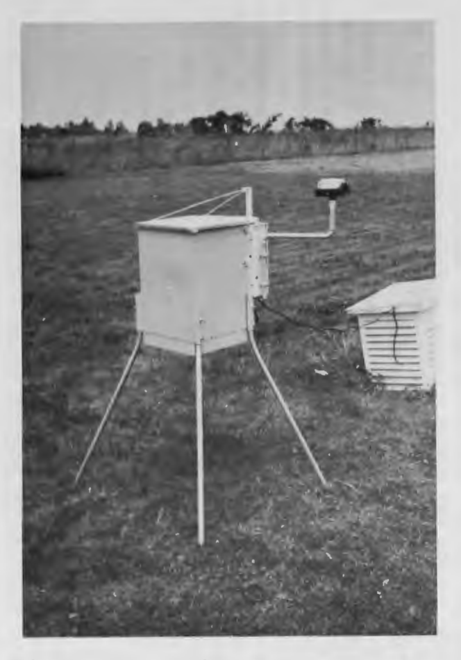
The precipitation sampler installed at Mount Forest, showing the lid in the closed position and, extending out to the right, the sensing head.