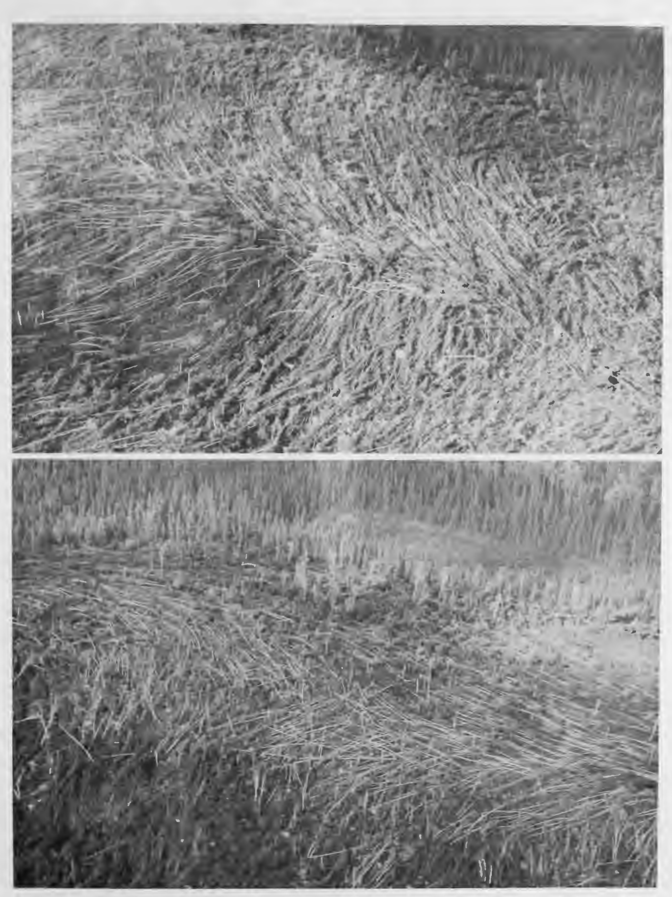
Aerial survey photographs of storm damage to forests between Sudbury and Timmins, Ont.