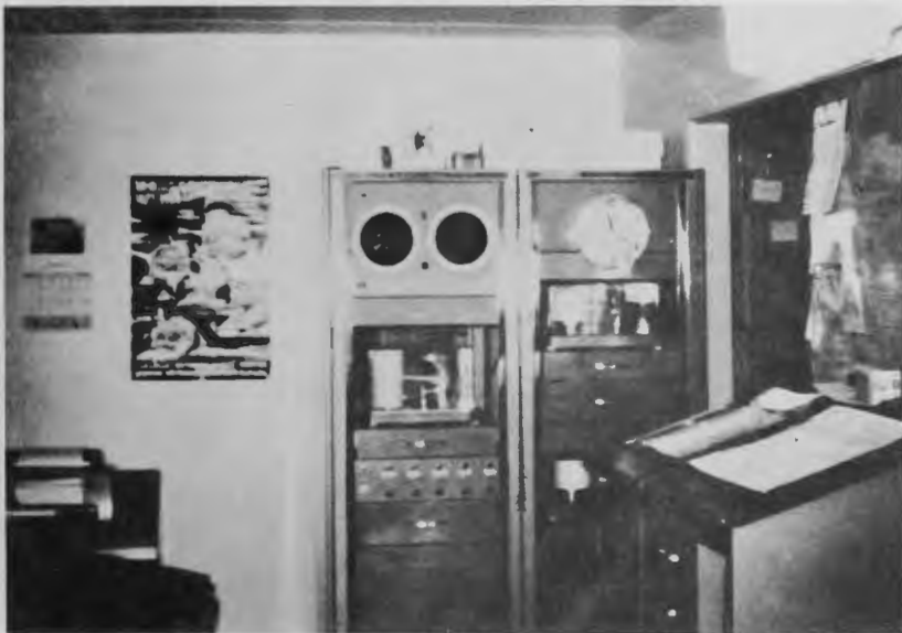
Intérieur station météo. NA