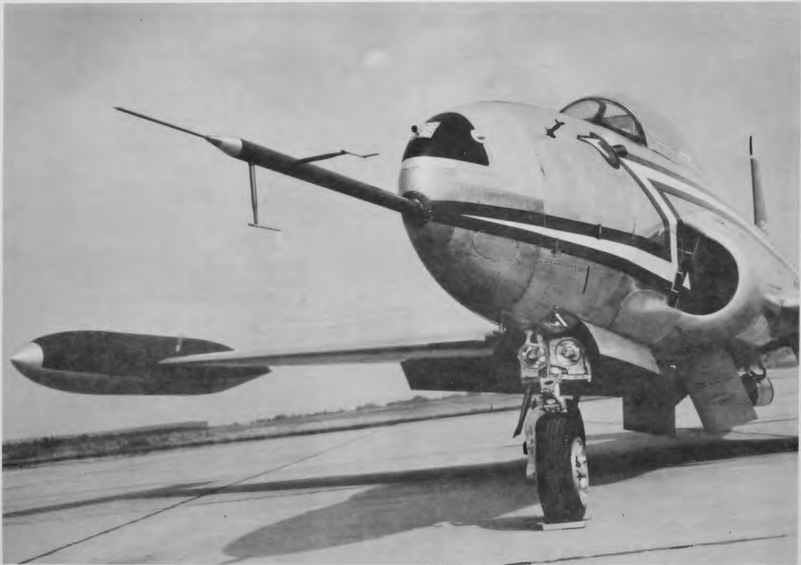
Close Up of Instrumentation on T-33