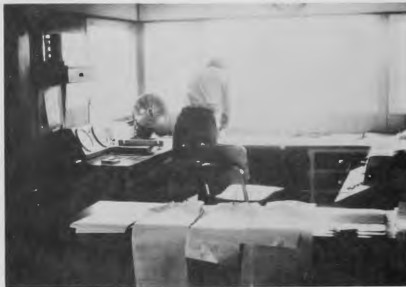
Intérieur station obs. GV