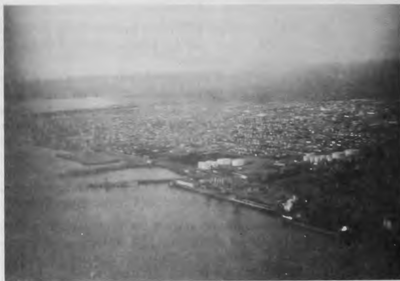
Ville vue de la Baie des Sept-Îles