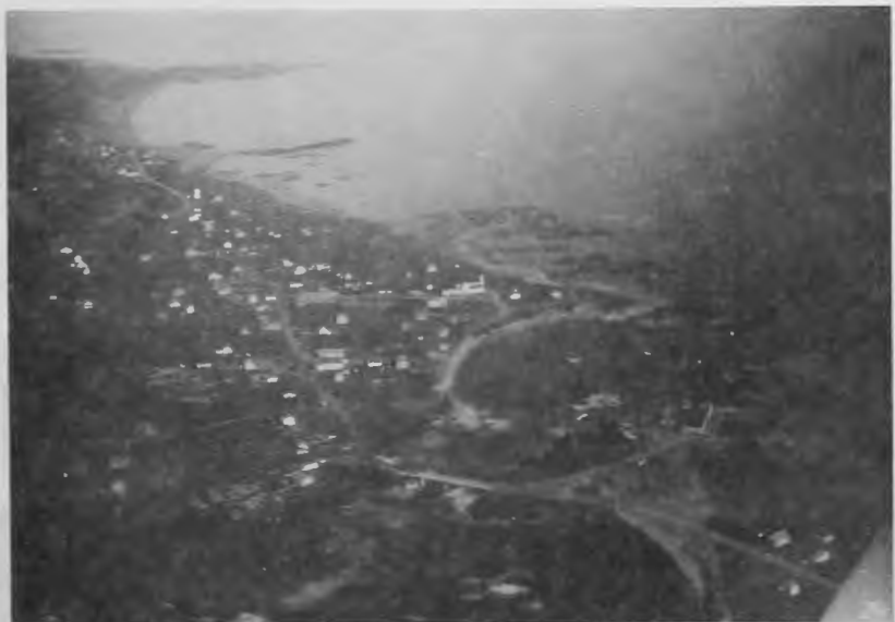
Rivière au Tonnerre et son port