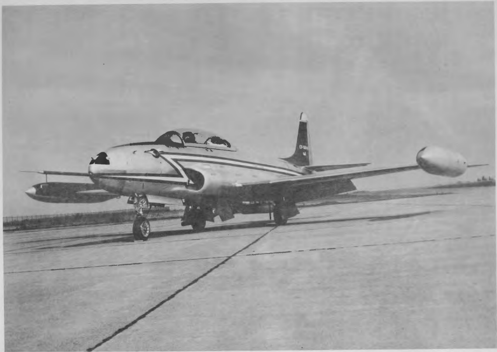
T-33 Used in Meso-scale and Boundary Layer Studies.