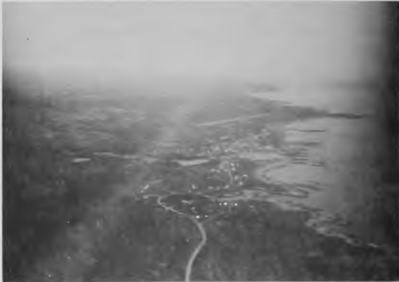
Vue de Rivière au Tonnerre sur moyenne Côte Nord