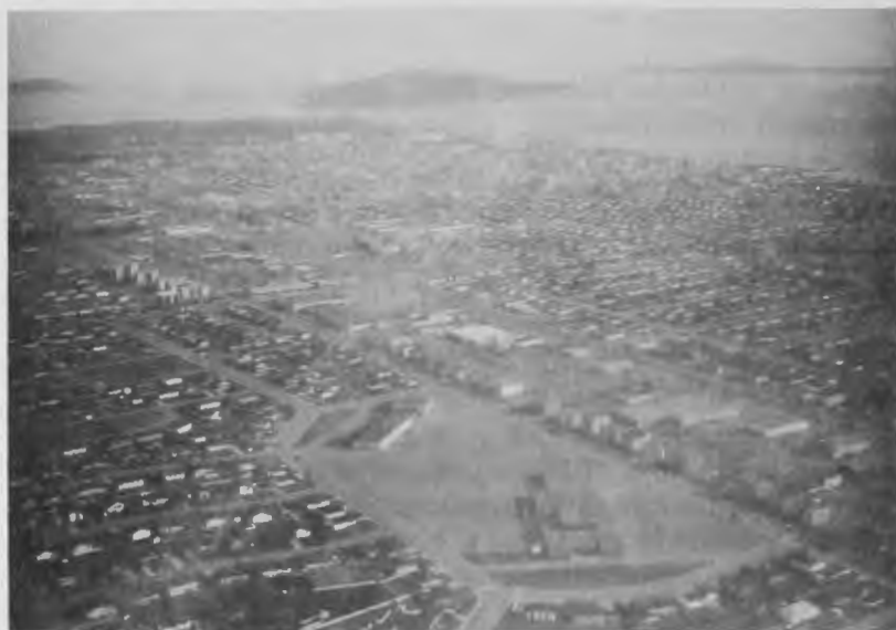
Ville de Sept-Îles avec vue sur les Îles