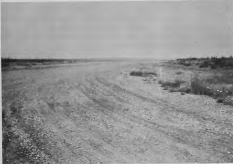
Piste de Hâvre St-Pierre en résidu de Titane