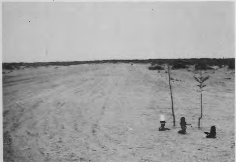
Piste de NA