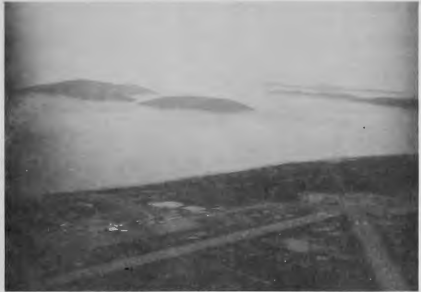
Aéroport Sept-Iles avec vue sur les Iles