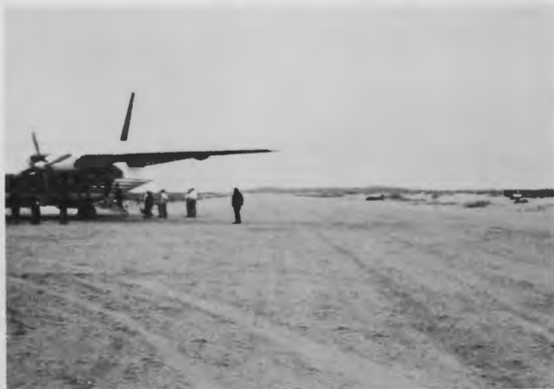
Piste de NA sable et gravier avec dune de sable sur les cotés