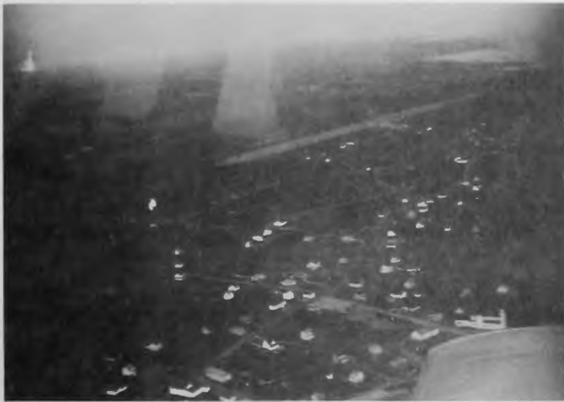
Rivière au Tonnerre avec vue de l'Aéroport