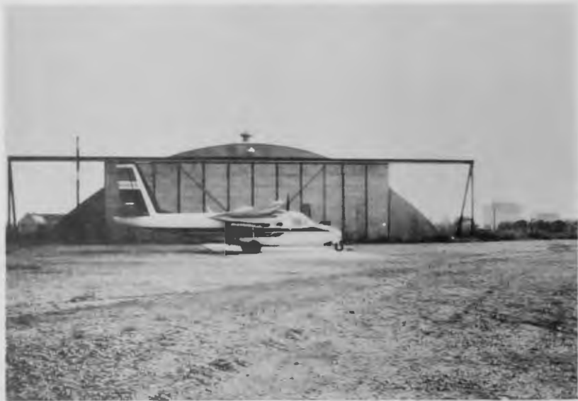
Avion de QTC et son hangar à GV