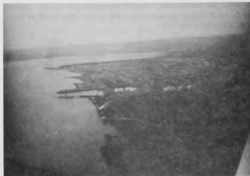
Ville de Sept-Îles avec vue quai chargement du fer