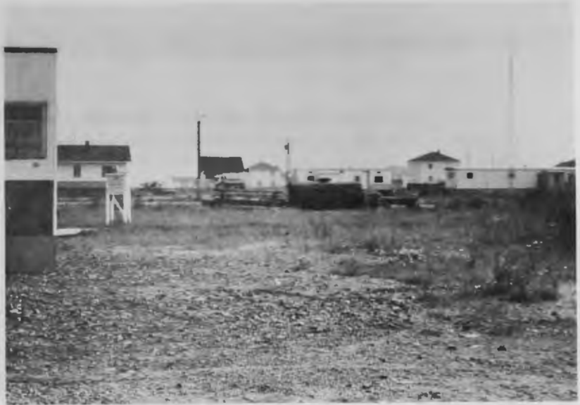
Site d'observation météo. GV