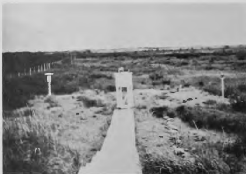
Site instrument NA