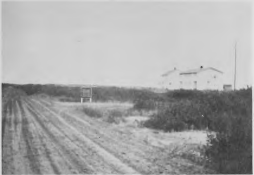
Station de météo. NA