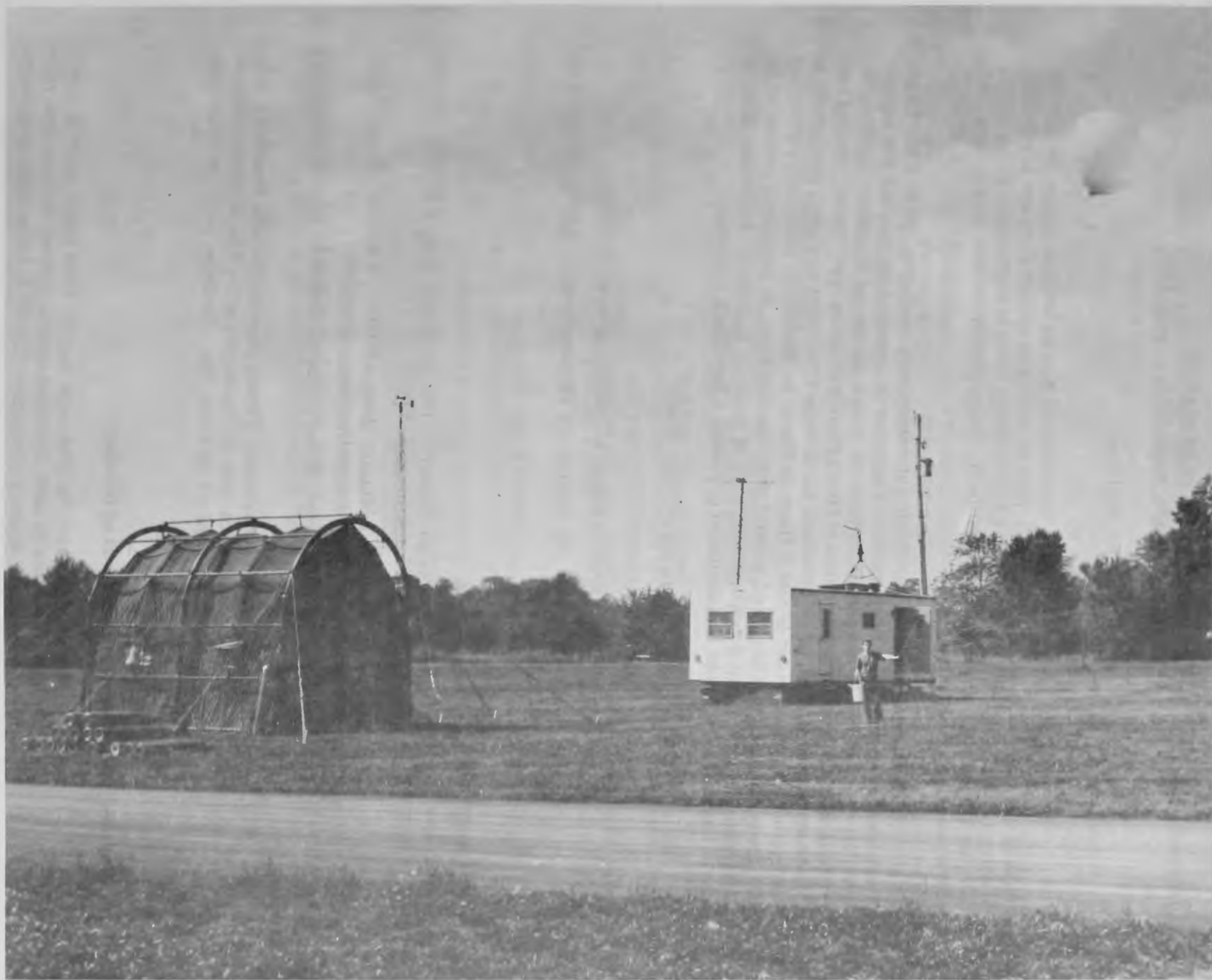
Figure 2. Field Station at Presqu'île Provincial Park.