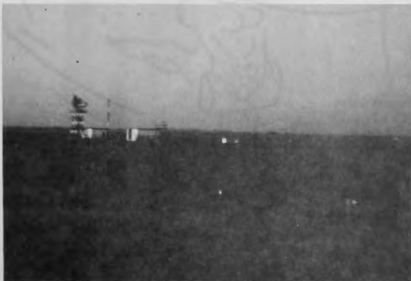
(Figure 2 alternate.)