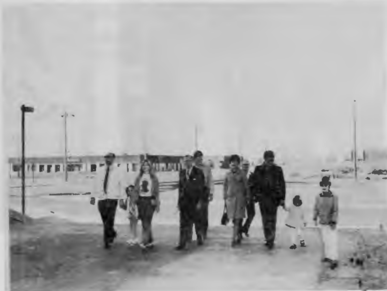
The Open House – October 30–31