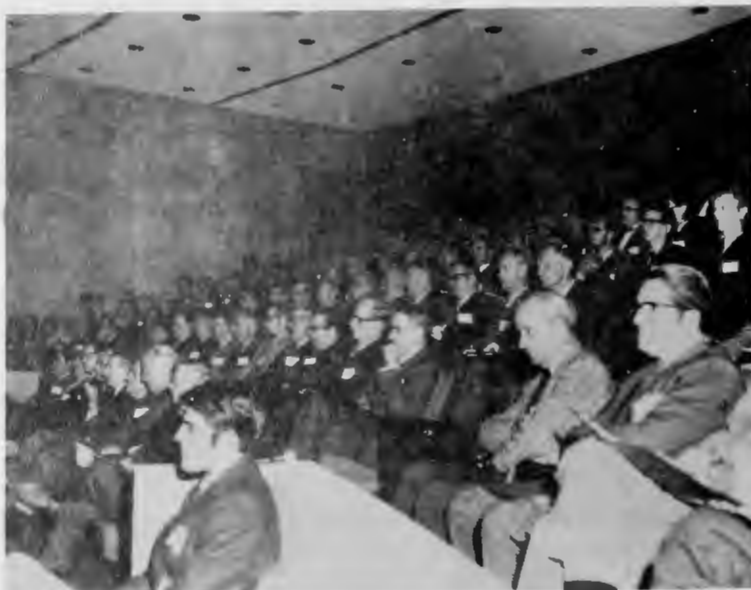
The Symposium – October 26-28