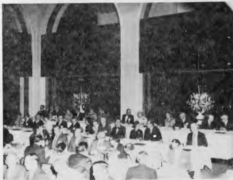
The Banquet – October 27