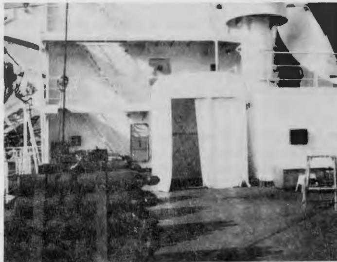
Helium tanks and balloon filling shelter W.C. Van Horn October 6, 1971

The W.C. Van Horne is on the regular coal run between Vancouver and Japan and is expected to make a round trip about every 28 days.