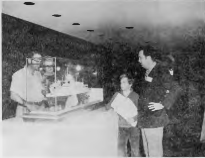
The Open House – October 30–31