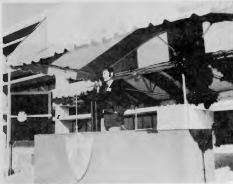
The Dedication – October 29