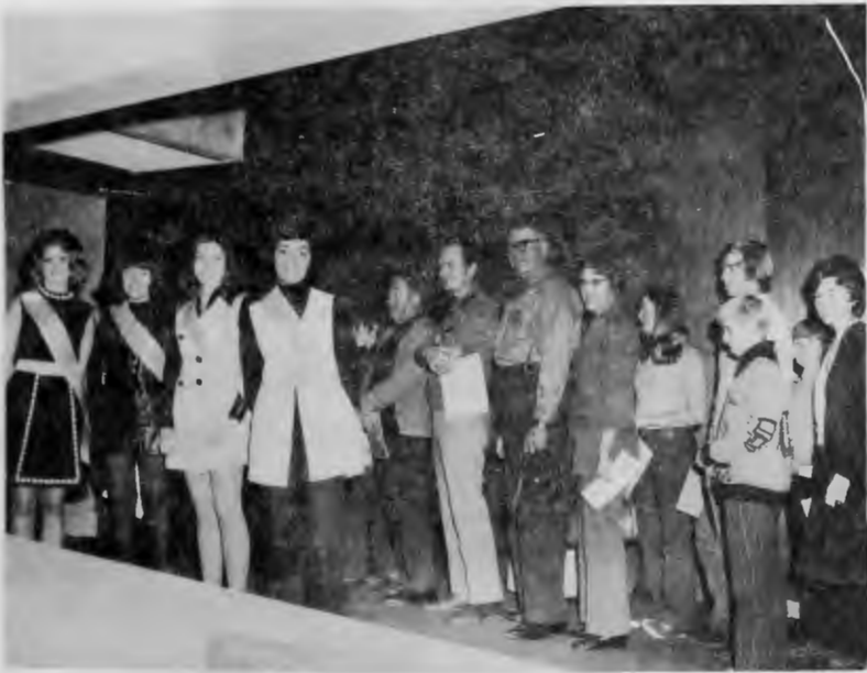
The Open House – October 30–31