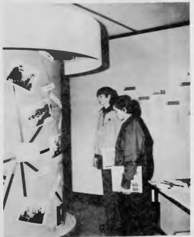
The Open House – October 30–31