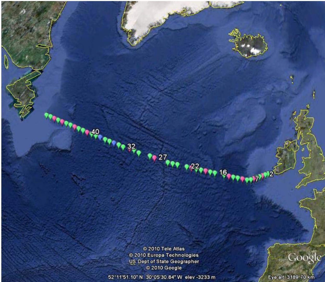
Fig. 1: Distribution of XBT's and XCTD stations. Green denotes XBT, Pink denotes XCTD and Blue denotes poor quality data

The initial oceanographic program consisted of XBT or XCTD deployment each 30 nautical miles. They began at the 200 m isobath south west of the Mizen, Ireland and ended on the Grand Banks, with exceptions on the evenings of the 1 st 2 nd and 3 rd of Feb when winds broached 60 knots and seas >12 m, making deployments impossible. All in all, 50 sampling stations were occupied on the East to West transect (Fig. 1). Many detailed thermohaline features were evident, the most striking being the dramatic decrease in surface temperature and salinity east of the Grand Banks at the front between the Labrador Current and North Atlantic Drift. In this region there was a strong halocline between 100-200m with well mixed waters below.