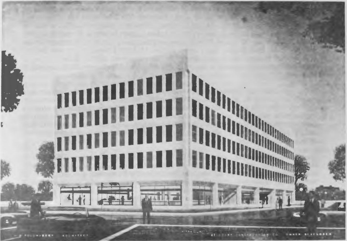
West Isle Office Tower