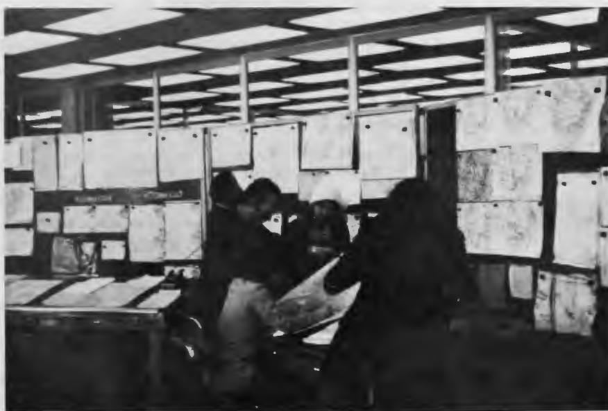
WINNIPEG WEATHER OFFICE "OPEN HOUSE"