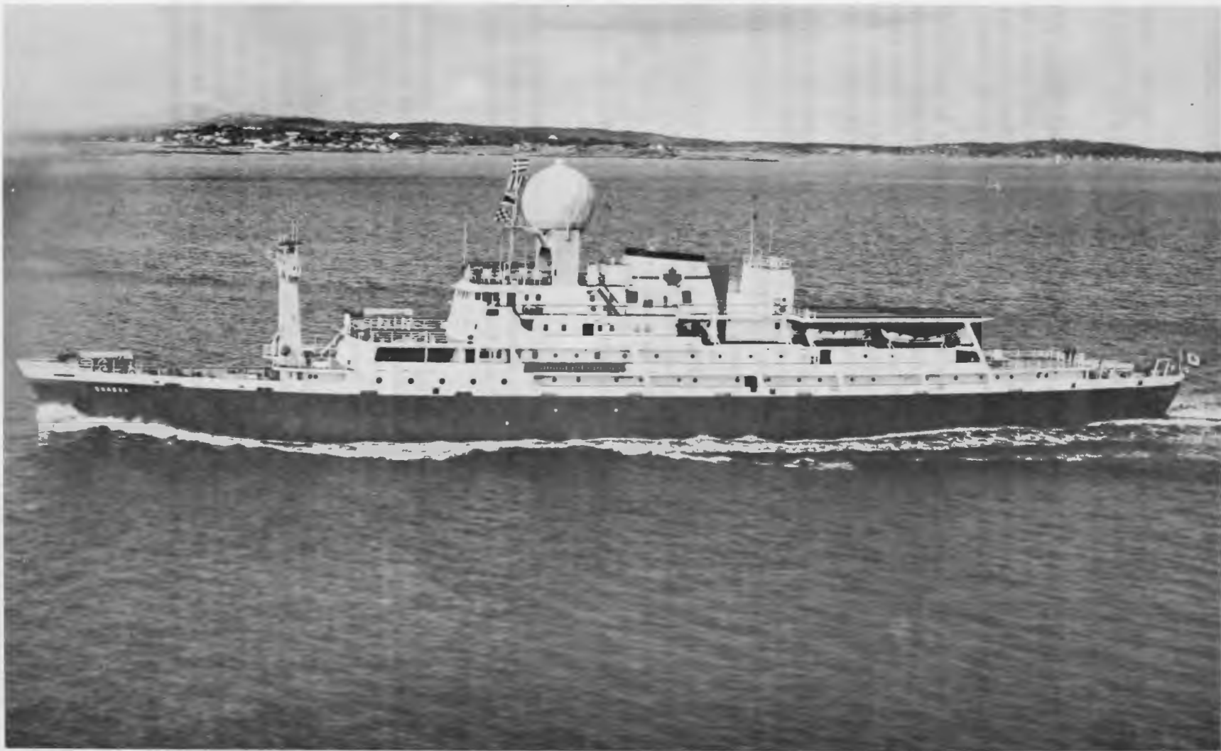
"CCGS QUADRA"