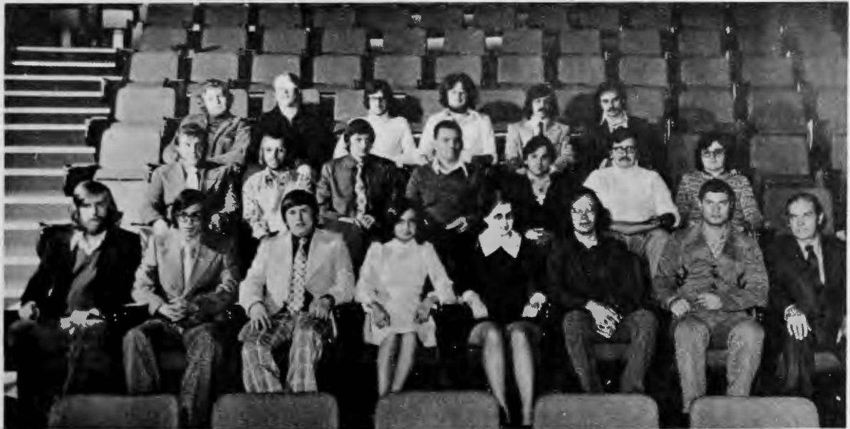
AOTC Course 7402

To all the graduates, we wish good fortune in their new career.