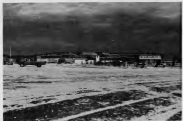
Hospital, school, recreation complex, Churchill.