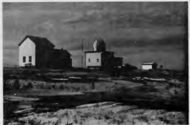
Upper air station – Churchill.