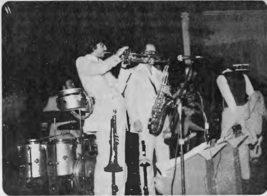
The New Nova Sounds – a real blast!