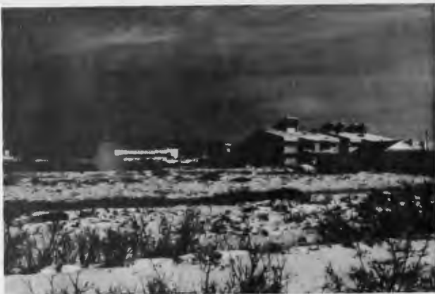
Federal apartment block and hospital residence for employees.