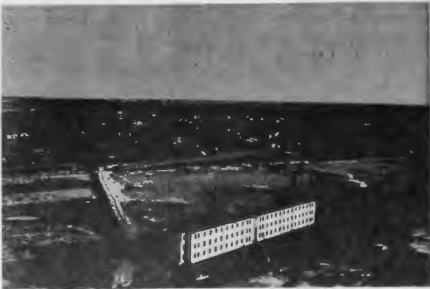
Looking at Townsite eastward from top of grain elevators.