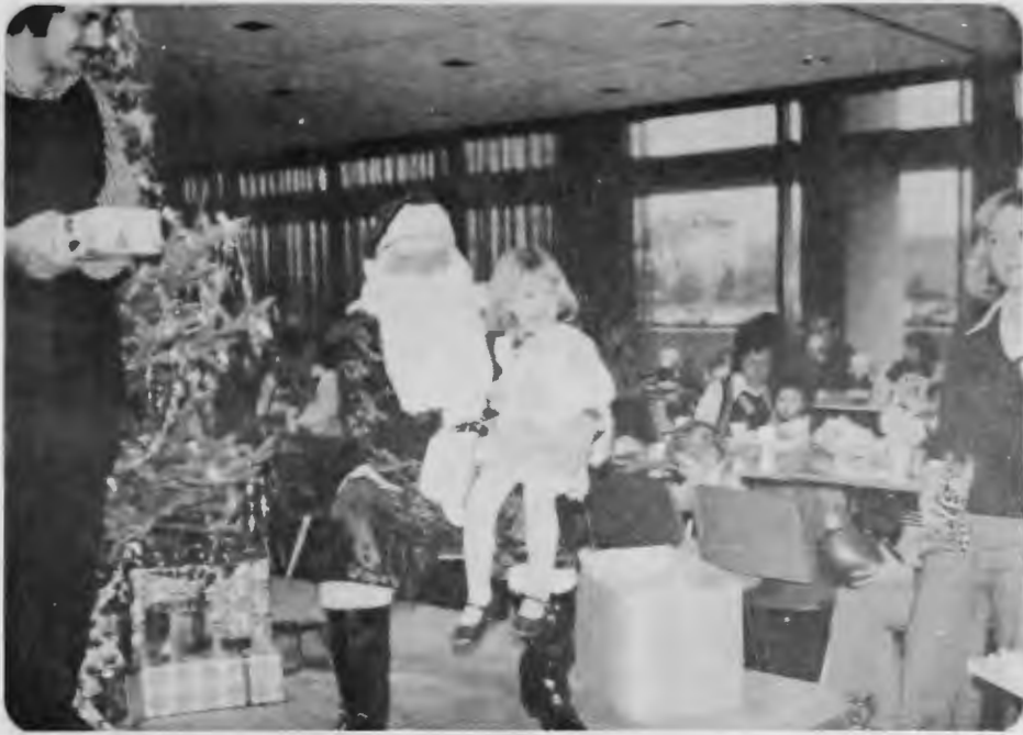
And . . . a mink coat, a Mercedes, and . . .