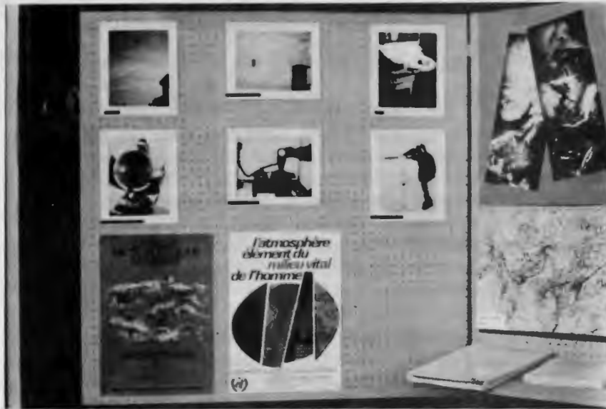
Le kiosque du bureau météorologique de Québec au centre commercial Laurier, les 23 et 24 mars 1973.