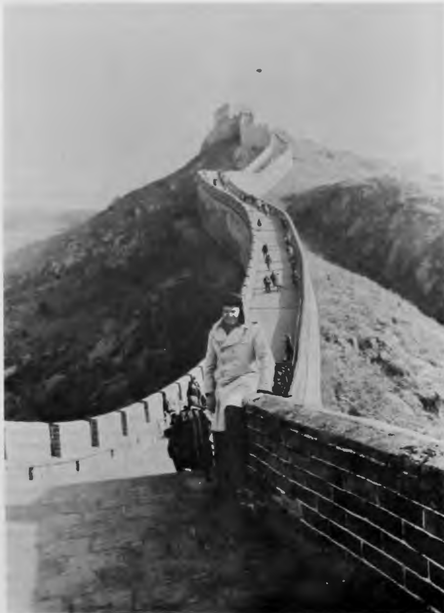
The Great Wall near Pataling

The World Meteorological Organization (WMO) through its technical co-operation program often searches for specialists around the world to provide expertise to nations who request it. Occasionally, Canadian expertise is sought and AES is pleased to give it.