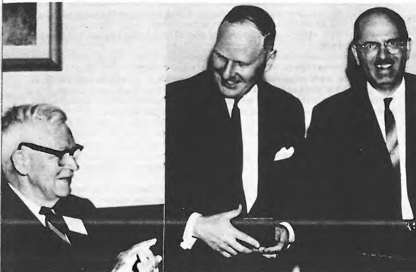
A ward of Patterson Medals